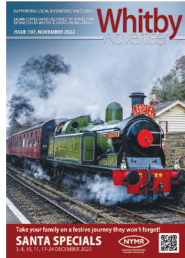
▲ Front cover, with lifestyle image and accompanying banner

We have a price on application for the above packages as rates can vary depending on season, demand and availability. If you are interested in any of the above packages please contact us.