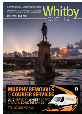
▲ Front cover, with 'showcase' advertisement